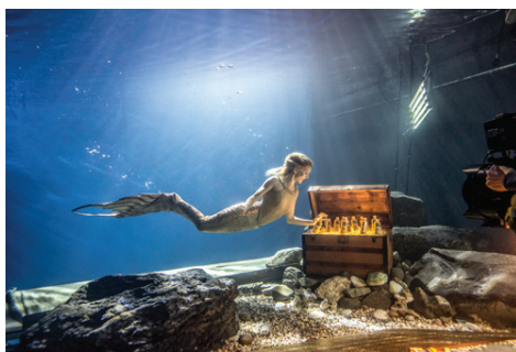
Behind the scenes at the Pantene Pro V Advert