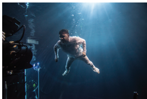
Gary Barlow promotional shoot for the Take That Wonderland Tour

Our equipment is available for hire with or without a safety team, or dive co ordinator.